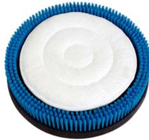
Dirt Napper 17" System