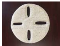
4-Quad Slotted Bonnits per Box