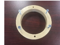
1-Riser with 4 Riser Bolts