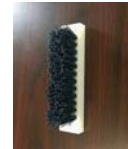
4 -.35gg Blue Grit Brushes