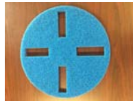
5-Scrubbing Pads per Box