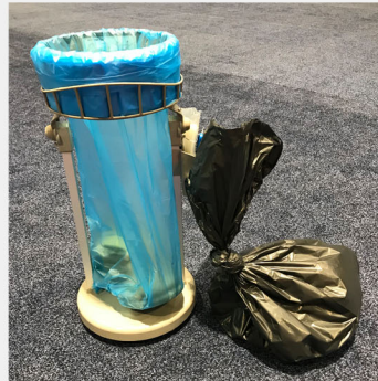
Longopac vs. regular trash bag