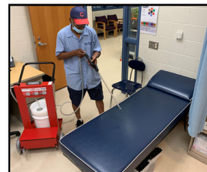
Use in Nurse's Office