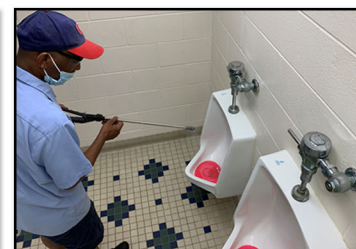
Use in Bathroom