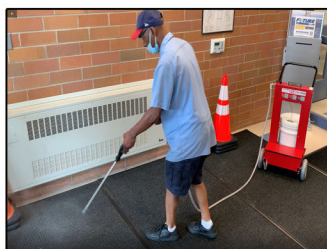
Use on Carpets/Mats