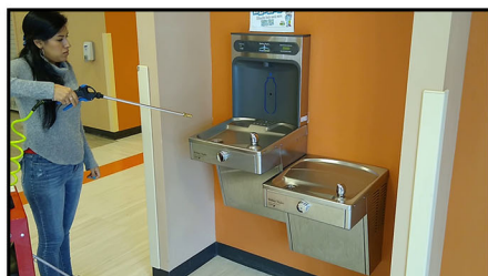
Use on Water Fountains